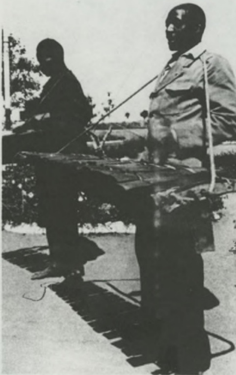
1. Chopi mbila (marimba) players at Quissico, Inhambane district, Mozambique

1. AFRICA. In some Bantu dialects the term 'rimba' (or 'limba') (for example, among the Mang'anja and Lomwe of Malawi and Mozambique) means a single-note xylophone. Rimba (or limba ) generally suggests a 'flattish object sticking out' (Nurse, p.35), such as a note or key of either a xylophone or a lamellaphone. 'Marimba' (or